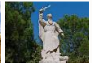
Mt. Carmel and Prayer Cave