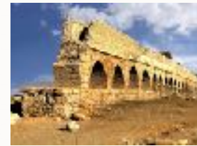
Caesarea Palaestina 133 AD

1 Night @ Netanya, Ramada Hotel 3 Nights @ Tiberias, Kibbutz Ein Gev 4 Nights @ Jerusalem, Yehuda Hotel