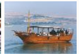
Beautiful Sea of Galilee