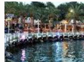
Kibbutz Ein Gev