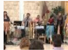
Kehilat Ha Carmel